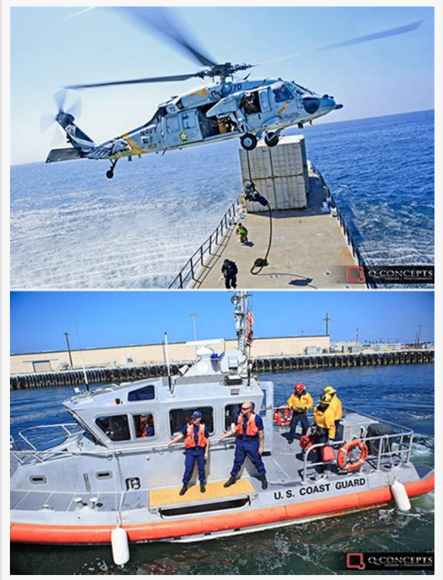
Coastal Trident 2023

The COP software's global scope has the potential to revolutionize how command and control systems