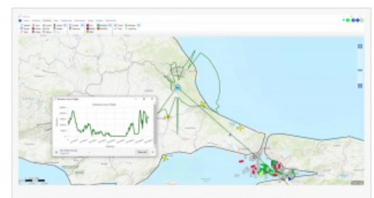
AGIS Radar Coverage Situation Diagram

Satellite ELINT data reveals the location and identification of radio and radars when they transmit. This information can be used to alert forces of the probability of impending hostile attack, the susceptibility of friendly forces to detection and attack, and provides data as to the probable composition of both friendly and hostile forces.