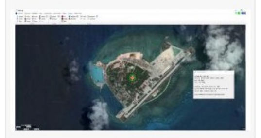
AGIS Image from Data on Militarized South China Sea Island