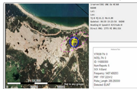
Correlating radar emitter data with satellite imagery

AGIS' ability to automatically create radar coverage diagrams depicted in our last C.O.P. NEWS is especially useful for amplifying received radar reports allowing analysis as to when radars will acquire an aircraft.