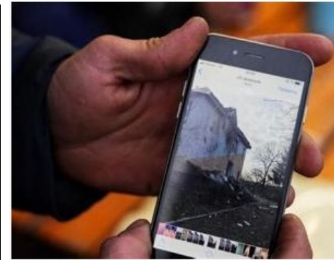
Secure Encrypted Collaboration on Smartphones

LifeRing features full C5ISR capabilities between users including in-app push-to-talk, chat, messaging, Geo-referenced symbol exchange, photos and Push to Talk between PC, Android and iOS users via their device browsers. This software supports an Extremely Large-Scale operations of 10,000 users in a highly-secure, encrypted environment. Provides a means to allow or to deceive others as to location.